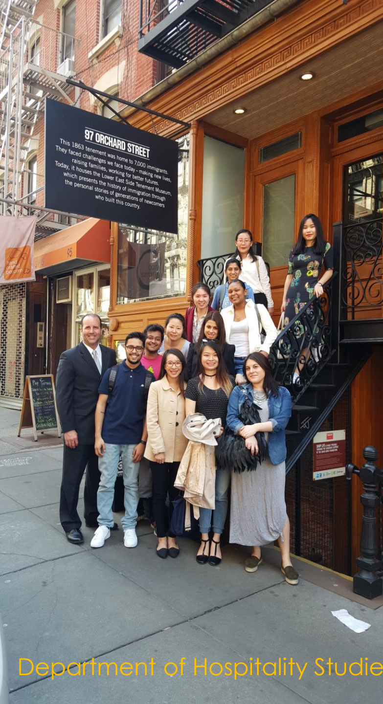
Department of Hospitality Studies